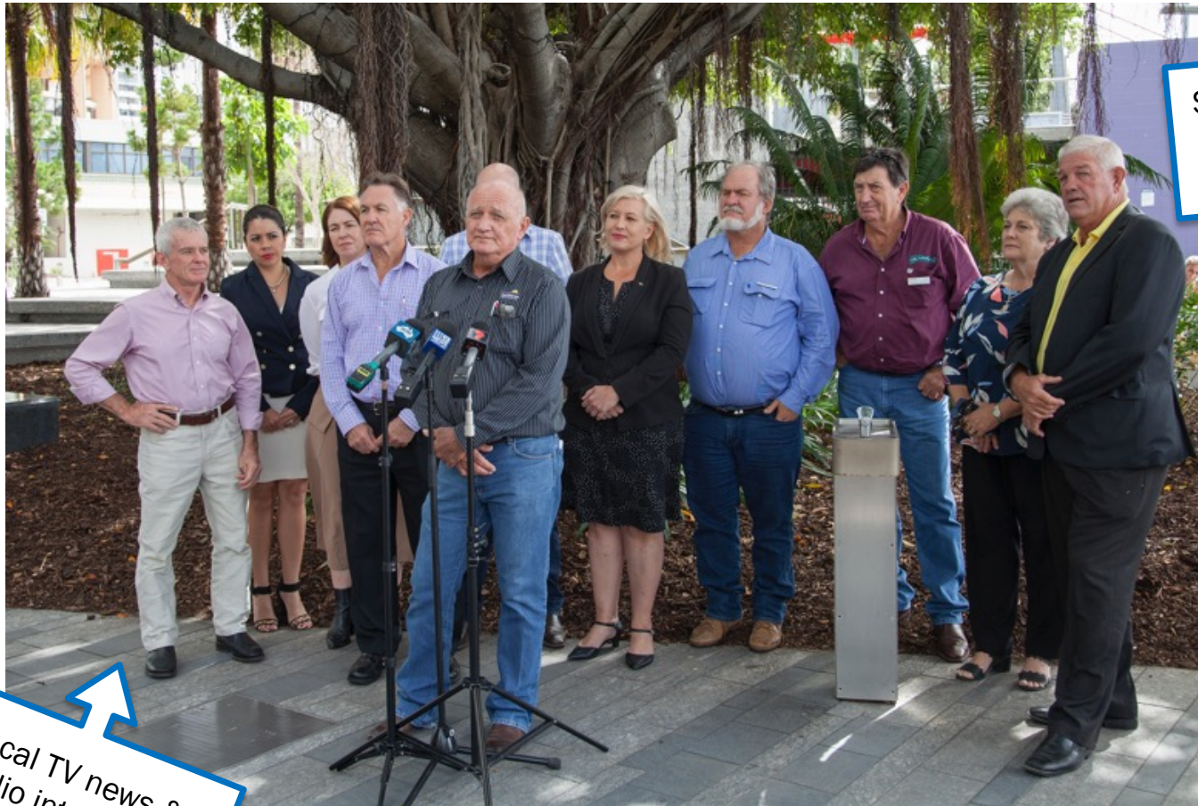
Local TV news & radio interviews