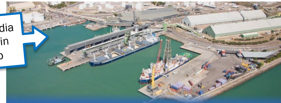
Social media post/ad in lead up

A STRONG TOWNSVILLE NEEDS A STRONG REGION!